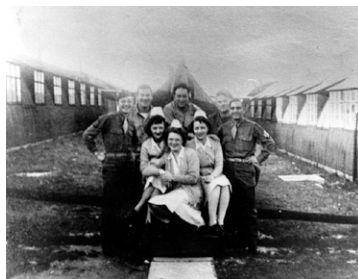
▲ Archive Nissen Huts

It is 80 years since the hospital opened as a US Army hospital supporting D Day and the liberation of Europe.