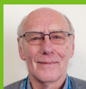
Who do Governors represent Page 3