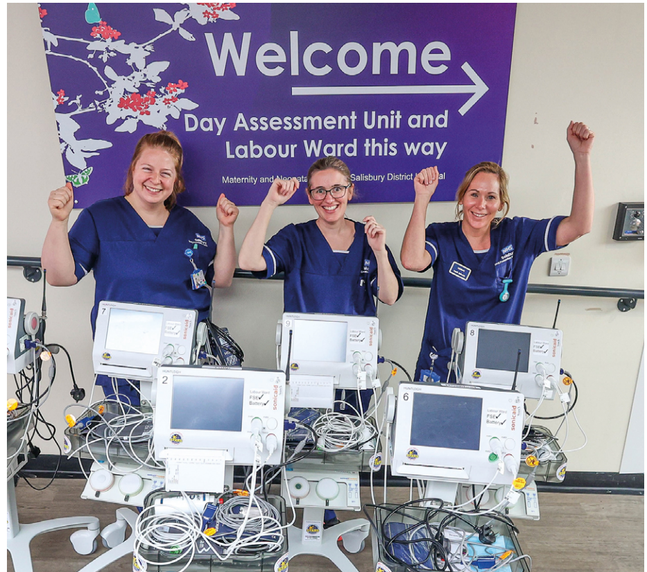
▲ Midwives celebrate the arrival of new CTG machines

Looking ahead, the Stars Appeal are focusing on raising £142,000 for a