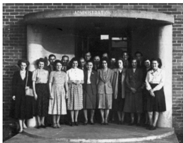
▲ NHS staff 1948