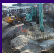
Hospital to get brand new ward Page 2