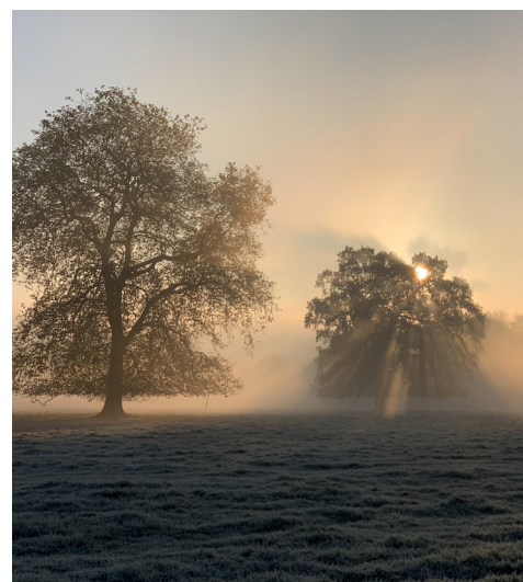
PALS message card project