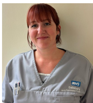
Clinical Nurse Specialist