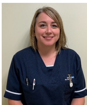
Sister / Senior Nurse