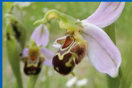
▲ Bee Orchid