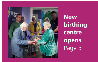
New birthing centre opens Page 3