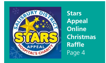
Stars Appeal Online Christmas Raffle Page 4