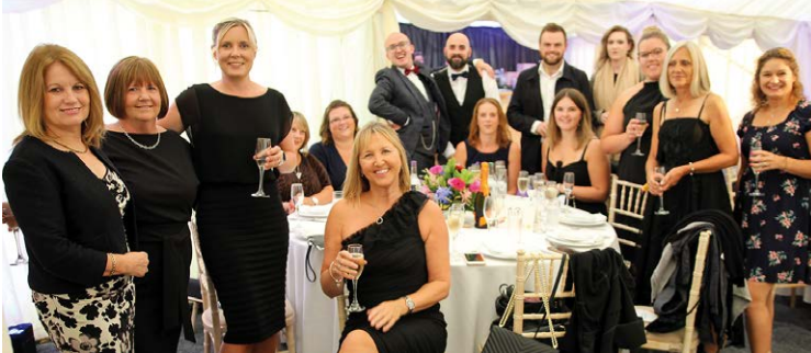
▲ The Central Booking Team, who won team of the year at the Staff Awards

period of mourning. This included the Family Fun Day, Staff Thank You Party, Long Service Awards, AGM and Volunteers Lunch. The awards and thank you events were made possible by generous support from the League of Friends and the Stars Appeal.