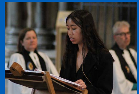
▲ Reflections on Pandemic service

Artcare and the CAHMS team from Oxford Health winning the award for successful ways to support biodiversity, and our communications team won the prestigious NHS Communicate Award