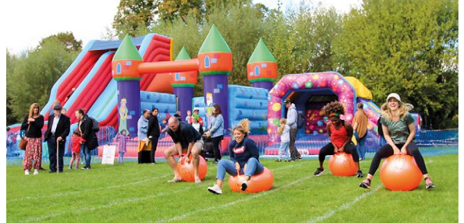
▲ Space hopper race at the rearranged family fun day