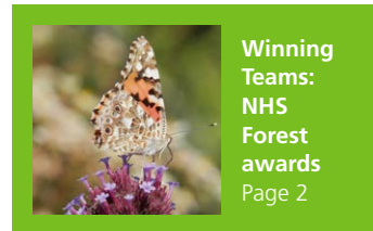
Winning Teams: NHS Forest awards Page 2