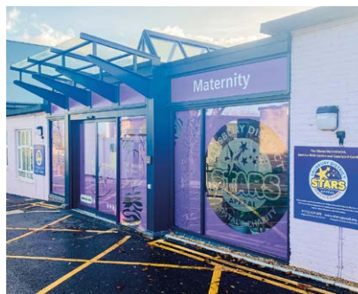
▲ The new birthing centre and maternity entrance, supported by generous donations to the Stars Appeal